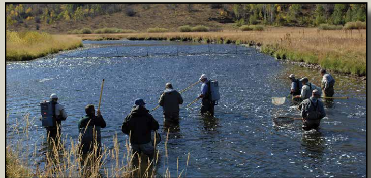
CFI conducting a fish population survey