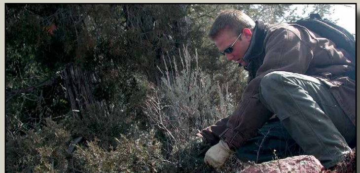
Detailed stream corridor analysis