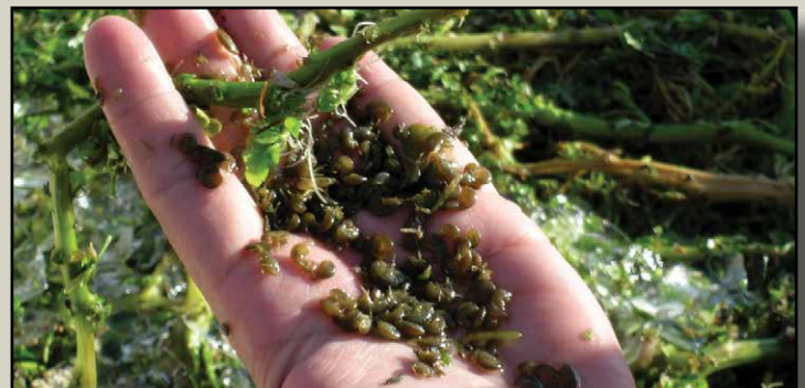
CFI's Freshwater Shrimp nursery